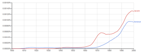
Figure 1. Frequency of the terms racism and feminism found in Google’s text corpora.

This Anglo-American institutional control of culture in the newly christened International Community clearly bears all the hallmarks of the Jouvenelian model, with its appeals to freedom and liberty in a self-effacing process. Two of the more influential developments in this regard deserve singling out as especially Jouvenelian in their development, and these are the now ubiquitous feminism and anti-racism. To see how utterly dependent these individualising and equalising concepts were on this patronage and the geopolitical pressures of the time, we can, again, return to the Google Ngram tool, and look at the historical frequency of the terms “feminism” and “racism” (Fig. 1). In doing so, what we see is exactly what we would expect to see, given the centrality of patronage and geopolitical conflict.